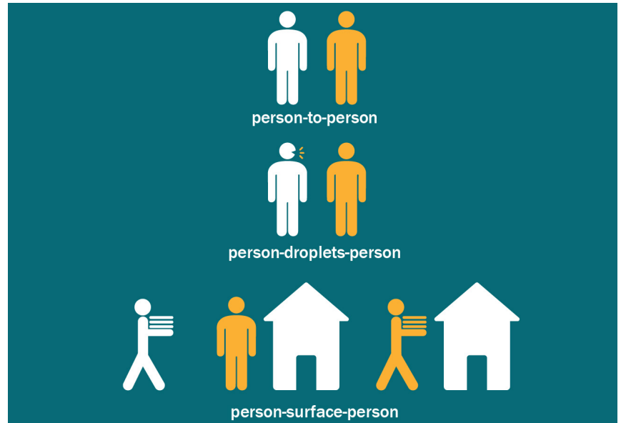
Fig. 1 The transmission routes of COVID-19

On Monday, March 16, 2020, Louisiana Gov. John Bel Edwards limited restaurants to only delivery, takeout or drive-through service to limit the spread of the new coronavirus that causes COVID-19. Since this decision, restaurants are relying on takeout, self-delivery and third-party delivery, such as Waitr and Uber Eats, to get food to their customers. Even though the new coronavirus is not a foodborne virus — which means it may not be transferred from food — the proven transmission routes are direct or indirect person-to-person contact. Therefore, there is a need for strict measures to minimize the risk of infection transmission during food delivery.