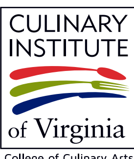
College of Culinary Arts of ECPI University